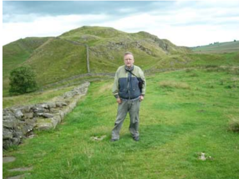
Me, and I felt twice as bad as I look

Below are some of the pictures taken at Hadrian's wall.